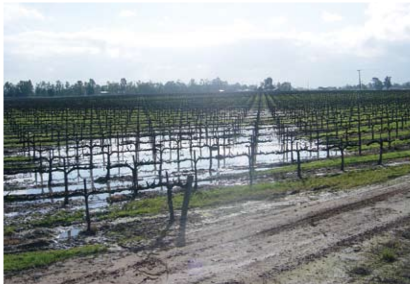
Figure 1: Water Penetration Problems in Grapes Near Lodi Due to Low Salts in the Irrigation Water and Soil

It has been field proven: for irrigation water to penetrate deeply into the soil, the electrical conductivity of the water needs to be greater than approximately 0.60 dS/m (decisiemens per meter). Irrigation water with less than 0.60 dS/m conductivity will contribute to loss of soil structure and increased water penetration problems. Many don't realize it, but the electrical conductivity of snow-melt runoff from the Sierra Nevada Mountains typically can have a reading of 0.02 dS/m or less. The real